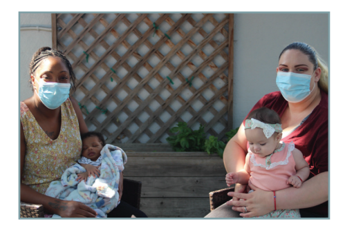
Hope House mothers with their babies