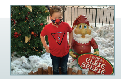
170 children of inmates participated in our socially distanced toy drive and 3,000 greeting cards and postage stamps were provided to all inmates.

services through electronic requests when unable to enter the jails due to pandemic restrictions. We successfully coordinated with jail staff to deliver all needed services to inmates. In-person services were available to inmates and their families in the Maguire Jail lobby five days a week.