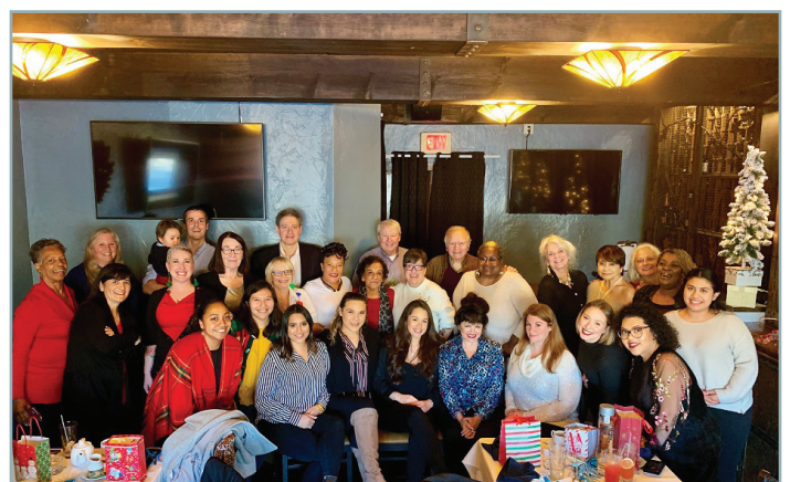
Service League/Hope House Holiday Appreciation Party

or mail check to: Service League of San Mateo County 727 Middlefield Road Redwood City, CA 94063 (650) 364-4664