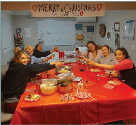
Hope House Holiday Cheer!