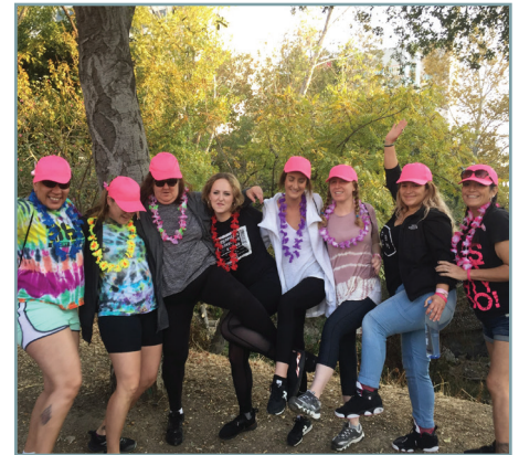
Hope House ladies raising funds to fight breast Cancer