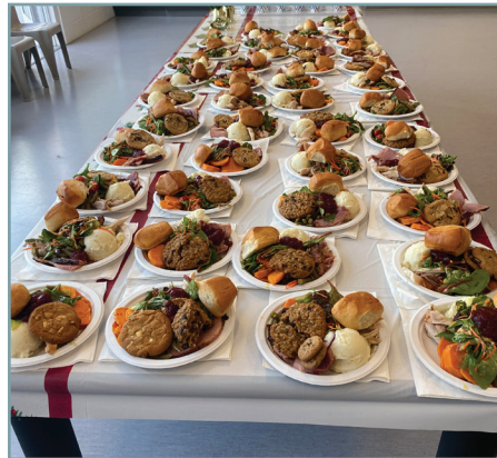
Serving up a delicious holiday feast for our SMC inmates