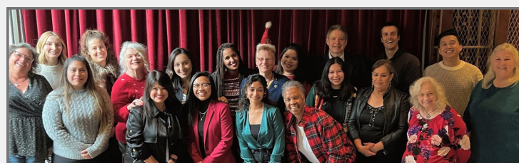
Service League & Hope House staff celebrate the holidays.