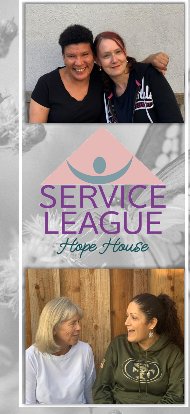
Friendships Flourish at Hope House

Phone: 650-363-8735 727 Middlefield Rd, Redwood City, CA 94063 Email: info@serviceleague.org